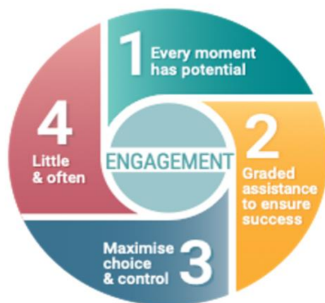
Figure 2. Four essentials of Active Support

The most recent versions of the Active Support training materials reduced the emphasis on paper-based activity or opportunity plans to avoid the focus shifting from practice to paperwork and box ticking, which had been observed as a tendency in some services. Training developed by the Tizard centre translates the theories that underpin Active Support into ‘the four essentials’ of practice taught to frontline staff (Beadle-Brown, Murphy, & Bradshaw, 2017) and Australian training follows a similar approach ( https://www.activesupportresource.net.au ). The four essentials of Active Support are represented in Figure 2.