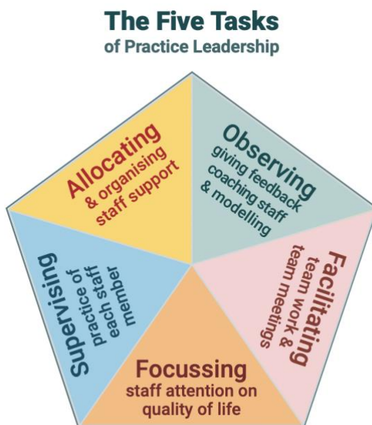
Figure 4. Five tasks of Frontline Practice Leadership